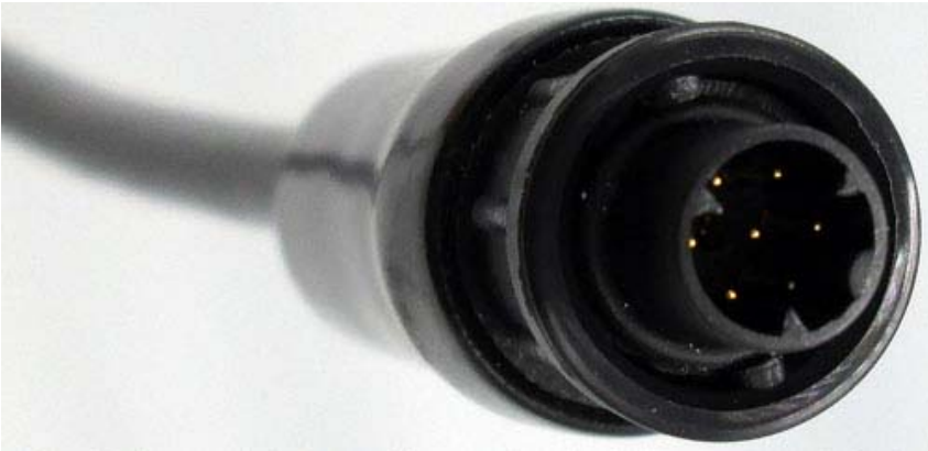
Q7M sensor end of cable snap connector detail close-up view