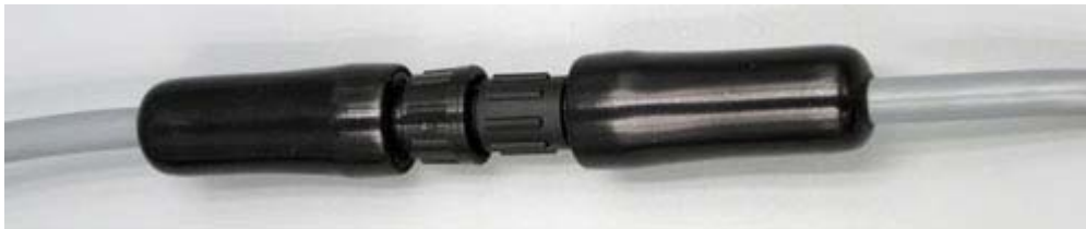
Q7M/Q7F snap connectors are NEMA 6P rated when interfaced.

Installation Guide for Q7M/Q7F Quick Disconnect Snap Connector for pH/ORP sensors with conventional integral preamplifiers; For all modern Rosemount & ASTI Transmitters