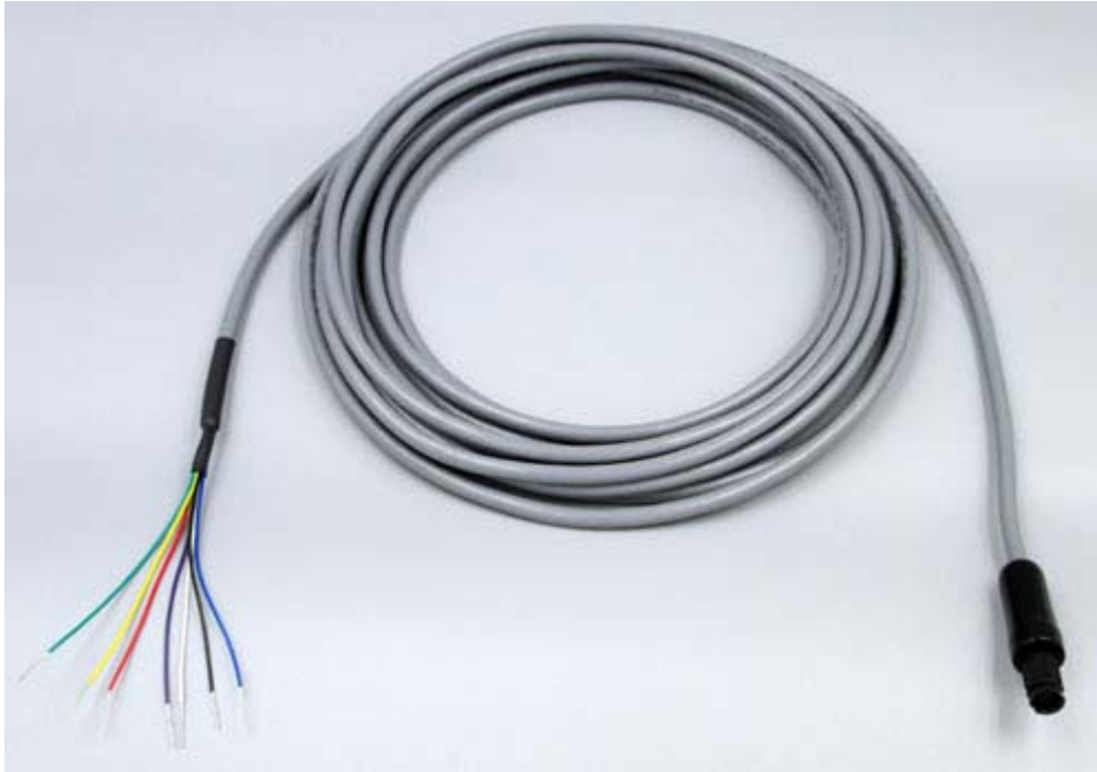
Q7F-Xm-TL Female Q7F snap to tinned leads extension cable