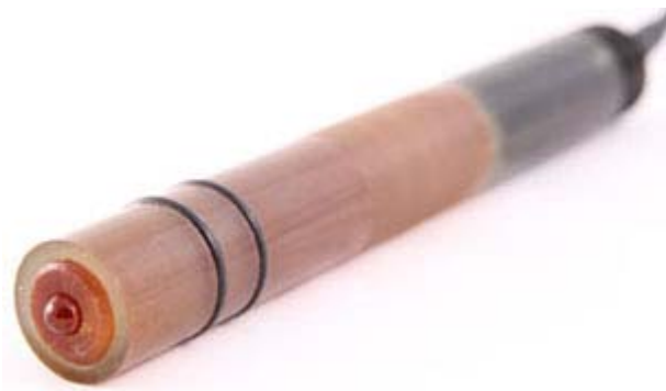
Model 5331 RADEL bodied sanitary pH sensor shown with low-profile break-resistant parabolic pH glass element for use in high viscosity and slurry abrasives type solutions in the without protective tines configuration