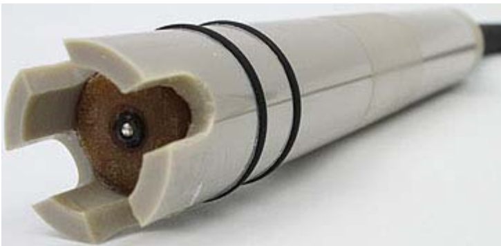
Model 5841 PEEK bodied sanitary ORP sensor shown with low-profile ball-style platinum ORP sensing element for use in high viscosity and slurry abrasives type solutions in the with 4 each "GR" protective tines configuration

APPLICATIONS FOR IOTRON™ IMMERSION SERIES BUILT-TO-ORDER pH SENSORS & ORP SENSORS WITH EXTENSIVE CUSTOMIZATION OPTIONS