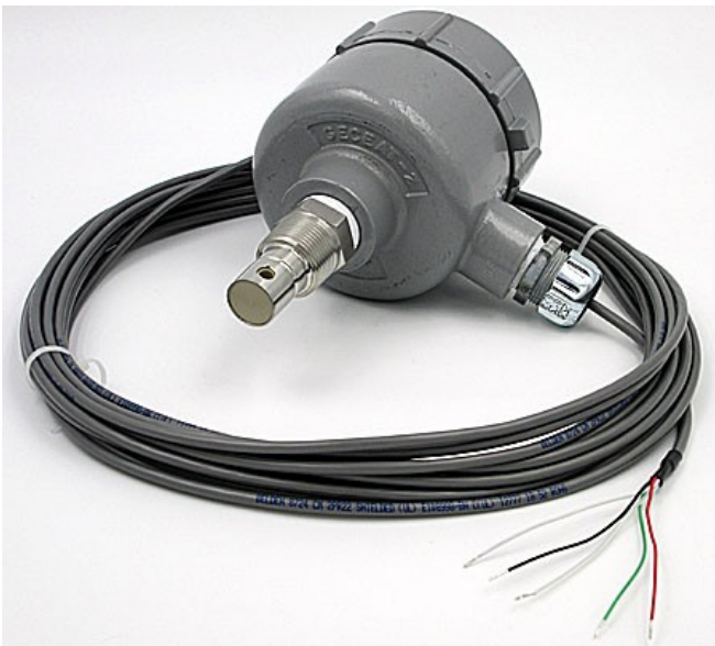
AST41 with K=2.0/\text{cm} Cell for High Conductivity Brine & Desalination Use

AST41 High temperature & pressure boiler condensate and blow down control. Double seal design extends sensor life over twice that of single or epoxy sealed units. Cell constants: 2.0, 1.0, 0.2, 0.1, 0.05. Temperatures to 205 °C and pressures up to 500 psig with PEEK insulator & 316SS electrodes standard.