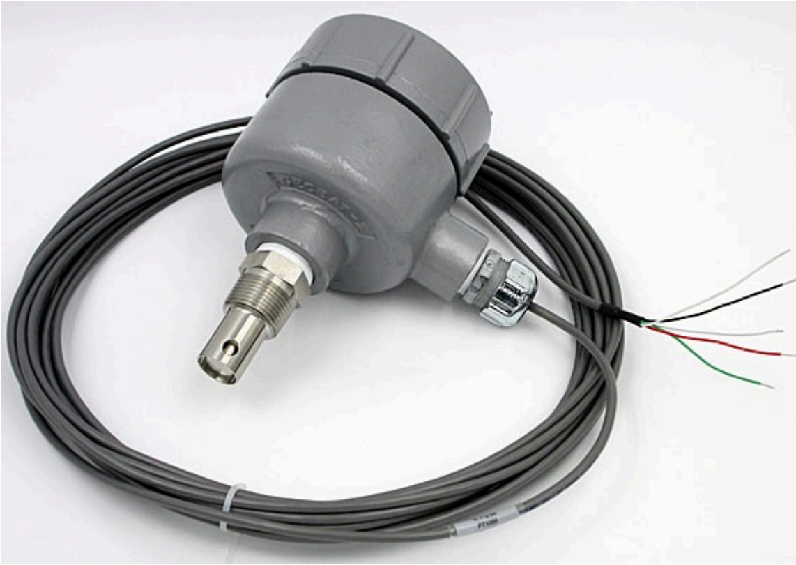
AST41 with K=0.05/\text{cm} Cell for RO & Ultrapure Water