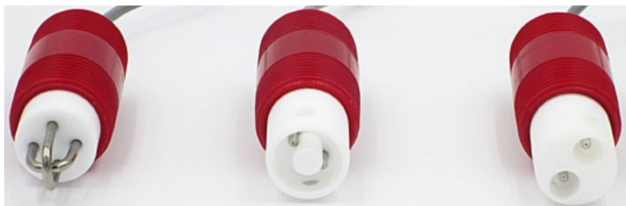
AST60 TEFLON-KYNAR High-Temperature Contacting Conductivity Sensor shown in the K=0.1/\text{cm} , K=1.0/\text{cm} and K=2.0/\text{cm} cell constant configuration from left to right