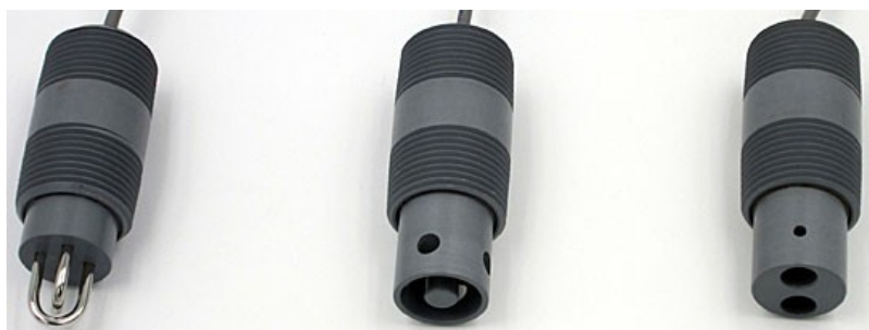
AST50 CPVC General Purpose Contacting Conductivity Sensor shown in the K=0.1/\text{cm} , K=1.0/\text{cm} and K=2.0/\text{cm} cell constant configuration from left to right