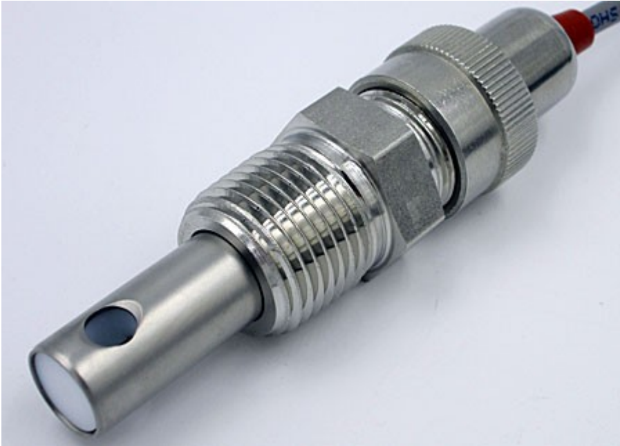
AST51 Sensor with K=1.0/cm Cell and \frac{1}{2} "MNPT 316SS Compression Fitting for use up to 500 psig