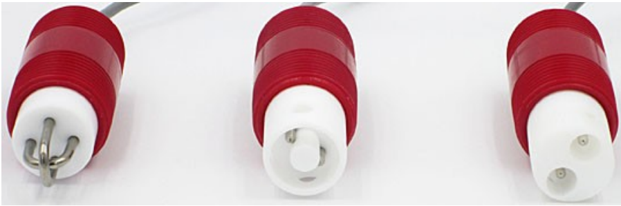
AST60 TEFLON-KYNAR High-Temperature Contacting Conductivity Sensor shown in the K=0.1/cm , K=1.0/cm and K=2.0/cm cell constant configuration from left to right