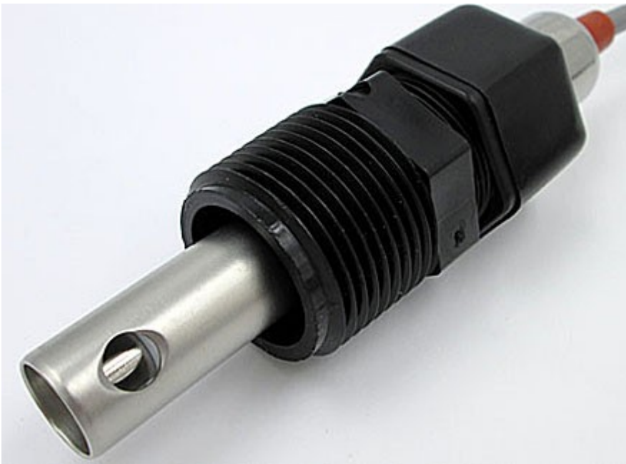
AST51 Sensor with K=0.1/cm Cell and \frac{3}{4} "MNPT Polypropylene Compression Fitting ( \frac{1}{2} "MNPT size also available)