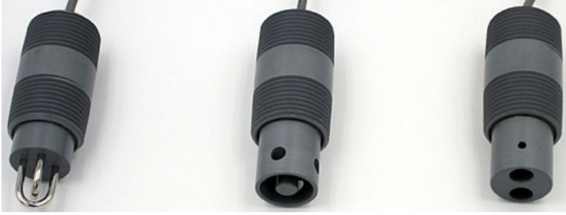
AST50 CPVC General Purpose Contacting Conductivity Sensor shown in the K=0.1/cm , K=1.0/cm and K=2.0/cm cell constant configuration from left to right