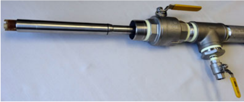
Complete HOT-TAP Valve Retractable Assembly Shown Above, Various Views